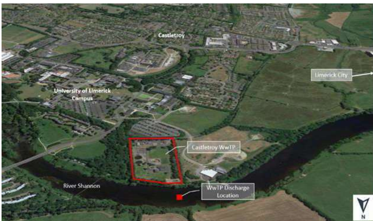
Figure 1.1: Castletroy WwTP and Discharge Point Locations

Castletroy is a Limerick suburb situated approximately 3km east of the City Centre. Castletroy WwTP is surrounded by the University of Limerick campus and the Lower River Shannon that runs past its northern boundary, Figure 1.1. The existing Castletroy WwTP operates as a conventional secondary treatment activated sludge plant. The WwTP discharge point is the Lower River Shannon which is designated both a Special Area of Conservation (SAC) (Lower River Shannon) and a Special Protected Area (SPA).